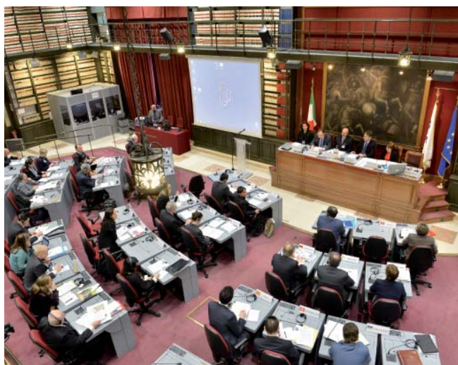
Chamber of Deputies Rome, Italy, 8 February, 2013