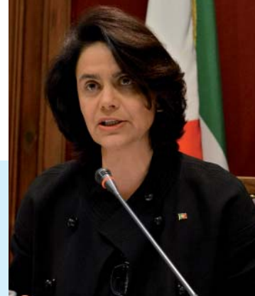
Teresa Morais Secretary of State for Parliamentary Affairs and Equality, Portugal